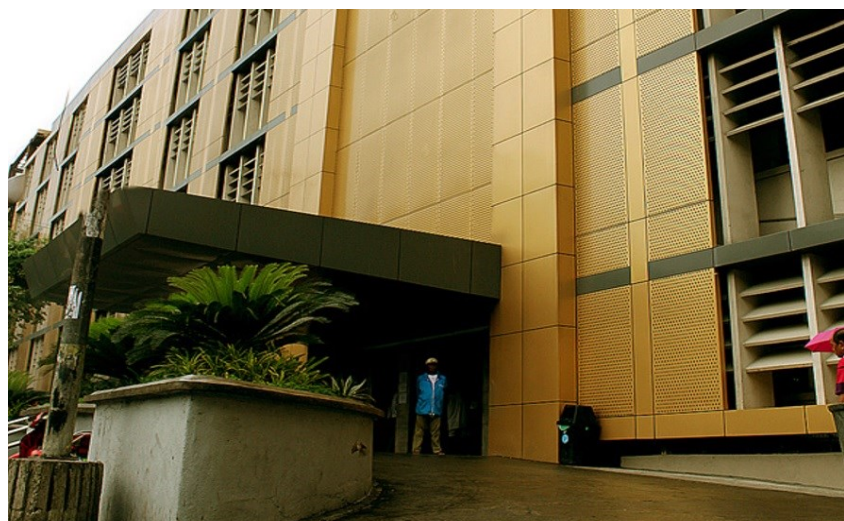
University of Santo Tomas Hospital Clinical Division