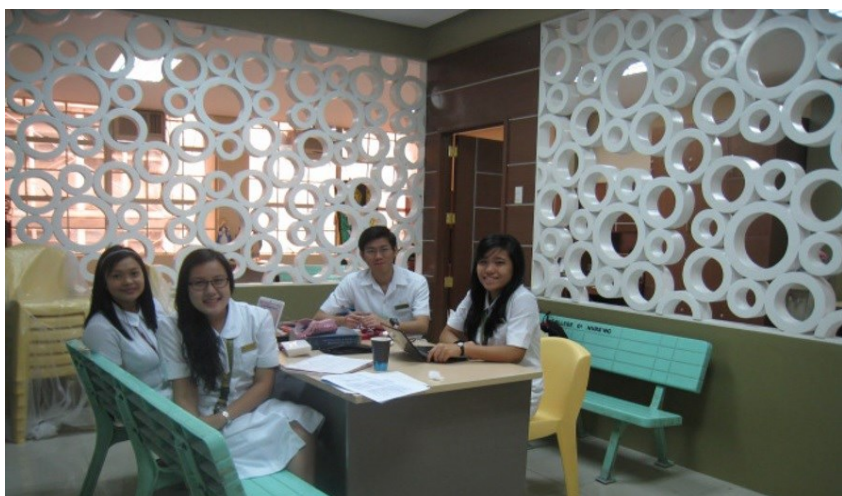
Student Organization Room