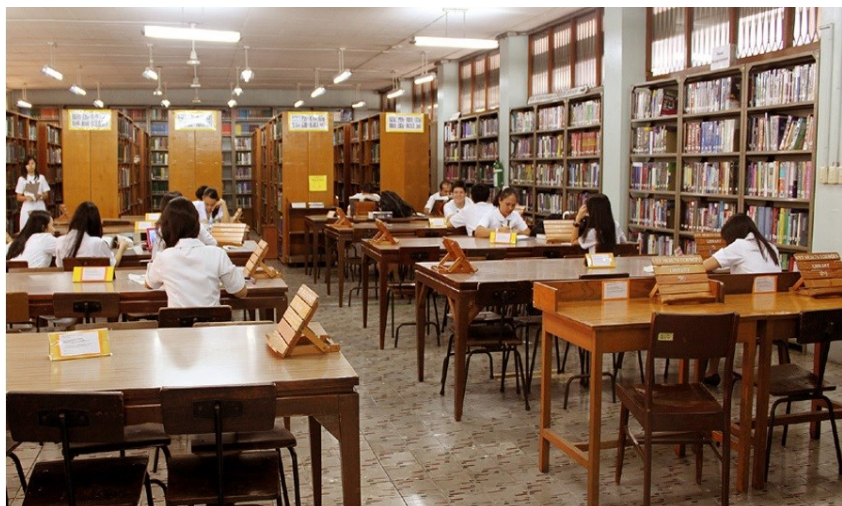
Health Sciences Automated Library