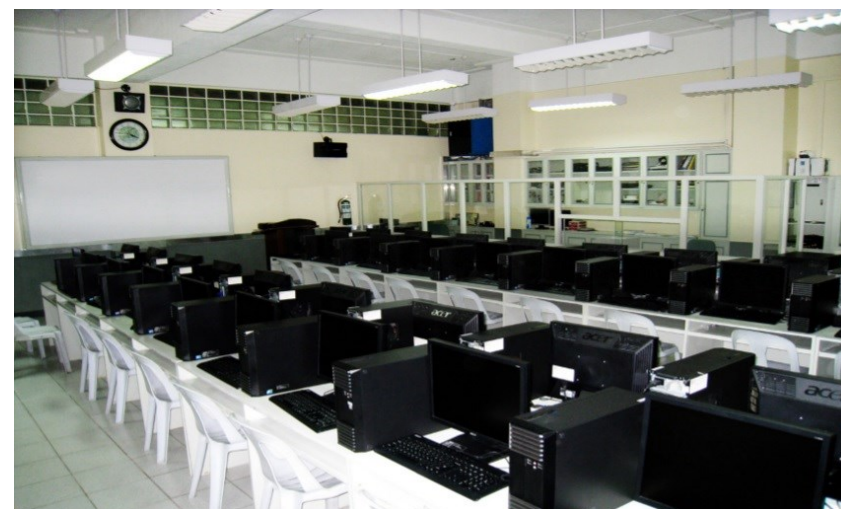
Nursing Informatics Laboratory

Unless stricter rules have been promulgated and applied in a particular faculty, college, or school, the following shall apply: