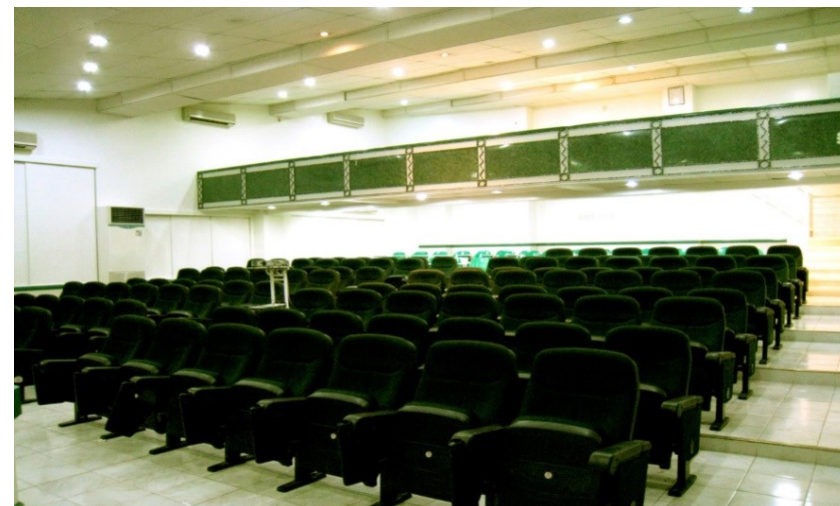
Hubert Wong Nursing Auditorium