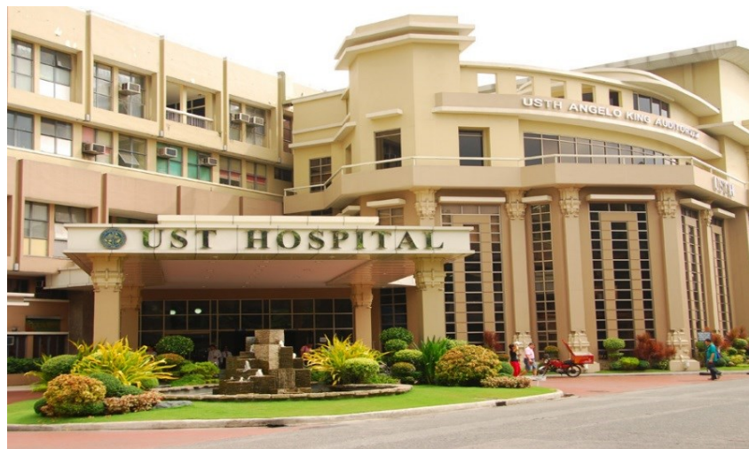
University of Santo Tomas Hospital Private Division